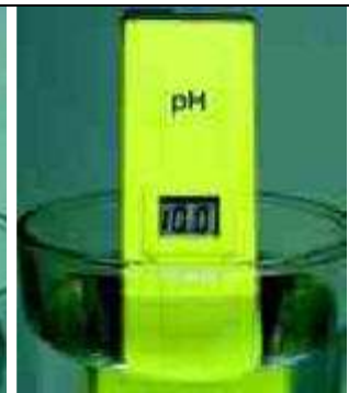
H2O Alkaline Water